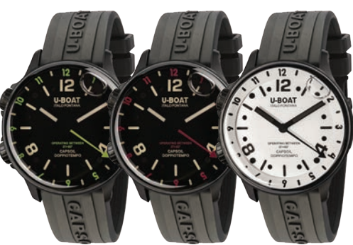
CAPSOIL DOPPIOTEMPO DLC - REF. 8840/8841/8889