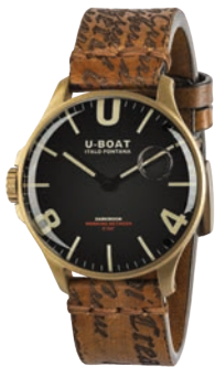
DARKMOON 44MM IP BRONZE - REF. 8467/B