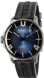
DARKMOON 44MM BLUE SS SOLEIL - REF. 8704/B