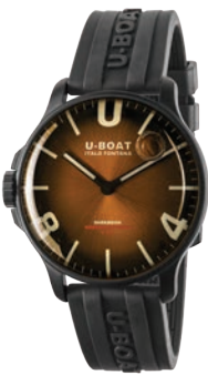
DARKMOON 44MM BROWN IPB SOLEIL - REF. 8699/B