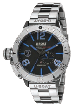
SOMMERSO BLUE METAL - REF. 9014/MT