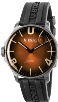
DARKMOON 44MM BROWN SS SOLEIL - REF. 8703/B