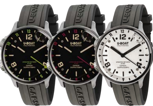
CAPSOIL DOPPIOTEMPO SS - REF. 8838/8839/8888