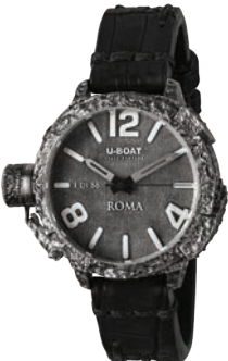
ROMA SILVER - REF. EU/ROME LIMITED EDITION 88 UNITS