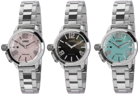
LADY CLASSICO 30 - REF. 8898/8899/8900