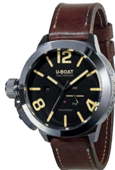
CLASSICO 50 TUNGSTENO MOVELOCK - REF. 8073