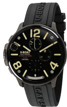
CAPSOIL TITANIO - REF. 8897