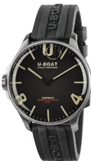
DARKMOON 44MM BLACK SS - REF. 8463/B