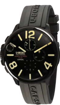
CHRONO DLC - REF. 8109/C