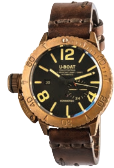
SOMMERSO BRONZE - REF. 8486