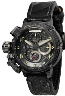
CHIMERA 46 CARBONIO/TITANIO - REF. 8057