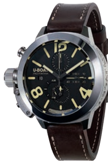
CLASSICO 45 TUNGSTENO MOVELOCK - REF. 8075