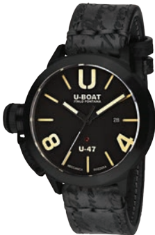
CLASSICO U-47 BLACK - REF. 9146