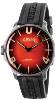
DARKMOON 44MM RED SS SOLEIL - REF. 8701/B