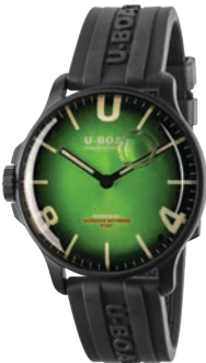
DARKMOON 44MM GREEN IPB SOLEIL - REF. 8698/B