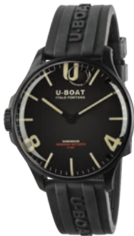
DARKMOON 44MM BLACK IPB - REF. 8464/B