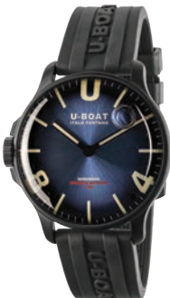
DARKMOON 44MM BLUE IPB SOLEIL - REF. 8700/B