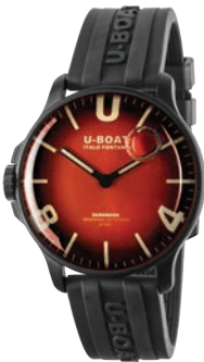
DARKMOON 44MM RED IPB SOLEIL - REF. 8697/B