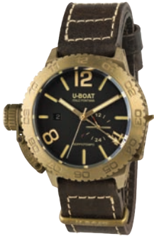
DOPPIOTEMPO 46 BRONZE BR - REF. 9008