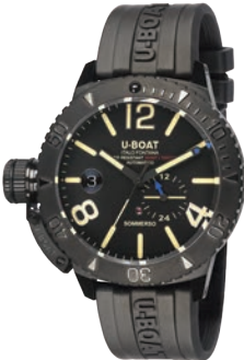
SOMMERSEO DLC - REF. 9015