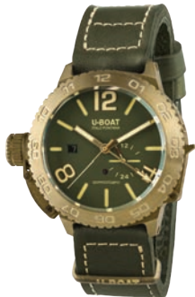
DOPPIOTEMPO 46 BRONZE GR - REF. 9088