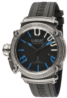
CLASSICO 47 1001 SS BLU - REF. 8038