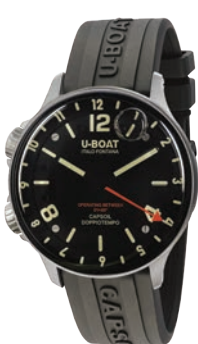
CAPSOIL DOPPIOTEMPO SS - REF. 8769