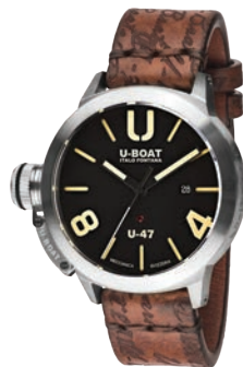
CLASSICO U-47 47MM AS1 - REF. 8105