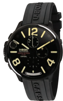
CAPSOIL TITANIO DLC - REF. 8896