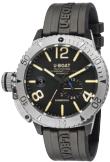
SOMMERSO/A - REF. 9007/A