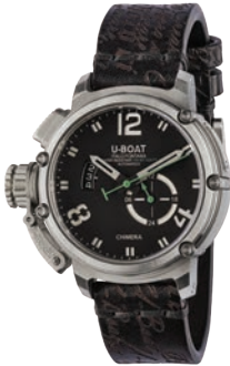
CHIMERA GREEN SS - REF. 8529

U-STRAP 7935/Z 22/22 U-BOAT BRACELET 22MM