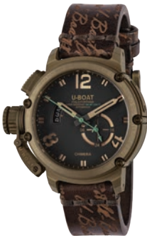
CHIMERA GREEN BRONZE - REF. 8527