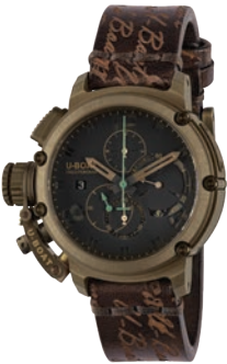
CHIMERA SAPPHIRE GREEN CHRONO BRONZE - REF. 8526

U-STRAP 7935/Z 22/22 U-BOAT BRACELET 22MM