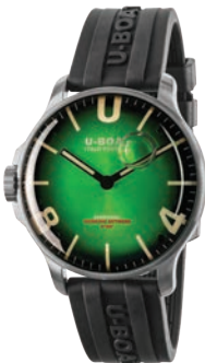
DARKMOON 44MM GREEN SS SOLEIL - REF. 8702/B