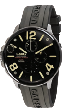
CAPSOIL CHRONO SS - REF. 8111/C