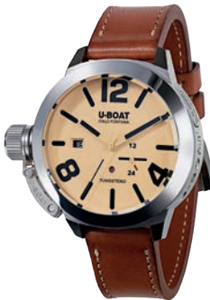
CLASSICO 45 TUNGSTENO MOVELOCK - REF. 8071