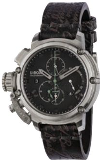
CHIMERA SAPPHIRE GREEN CHRONO SS - REF. 8528

U-STRAP 7935/Z 22/22 U-BOAT BRACELET 22MM