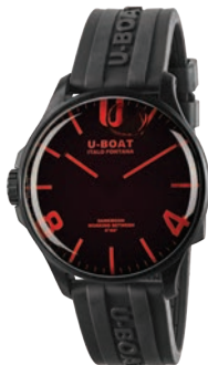
DARKMOON 44MM RED GLASS IPB - REF. 8466/B