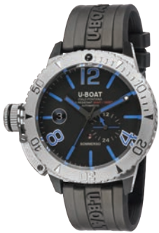
SOMMERSO BLUE - REF. 9014