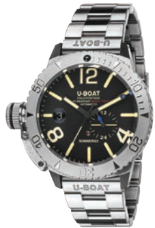
SOMMERSO/A BRACELET - REF. 9007/A/MT