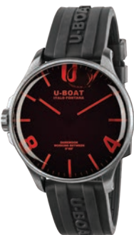
DARKMOON 44MM RED GLASS SS - REF. 8465/B