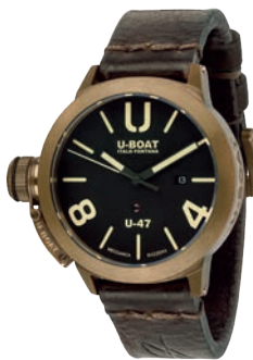
CLASSICO U-47 BRONZE - REF. 7797