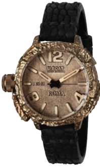
ROMA BRONZE - REF. EU/ROME/BZ LIMITED EDITION 88 UNITS