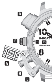
POSITION 1 NEUTRAL POSITION