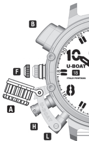
POSITION 2 FIRST CLICK