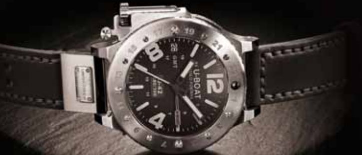
U - 4 2 G M T