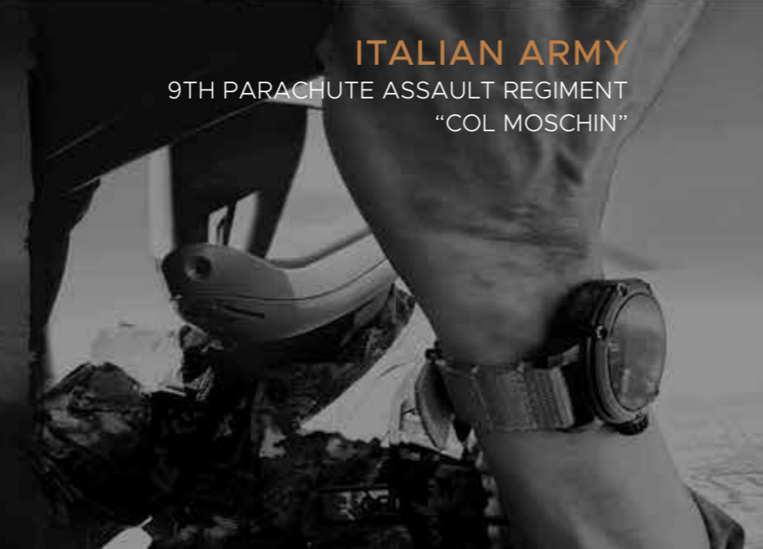
ITALIAN ARMY 9TH PARACHUTE ASSAULT REGIMENT "COL MOSCHIN"