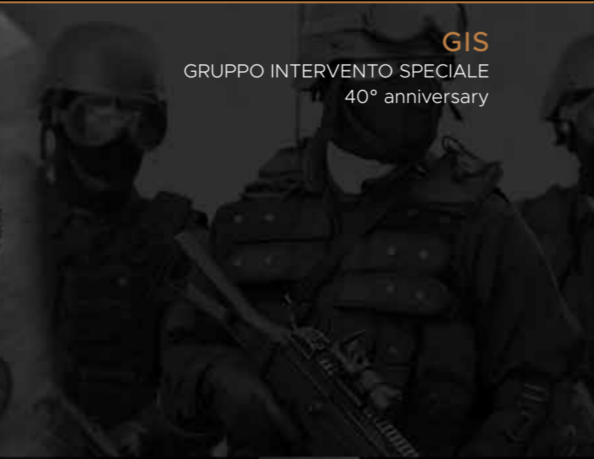
GIS GRUPPO INTERVENTO SPECIALE 40° anniversary