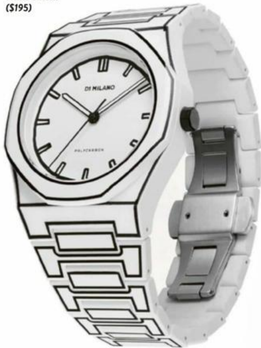
D1 Milano White Sketch ($195)